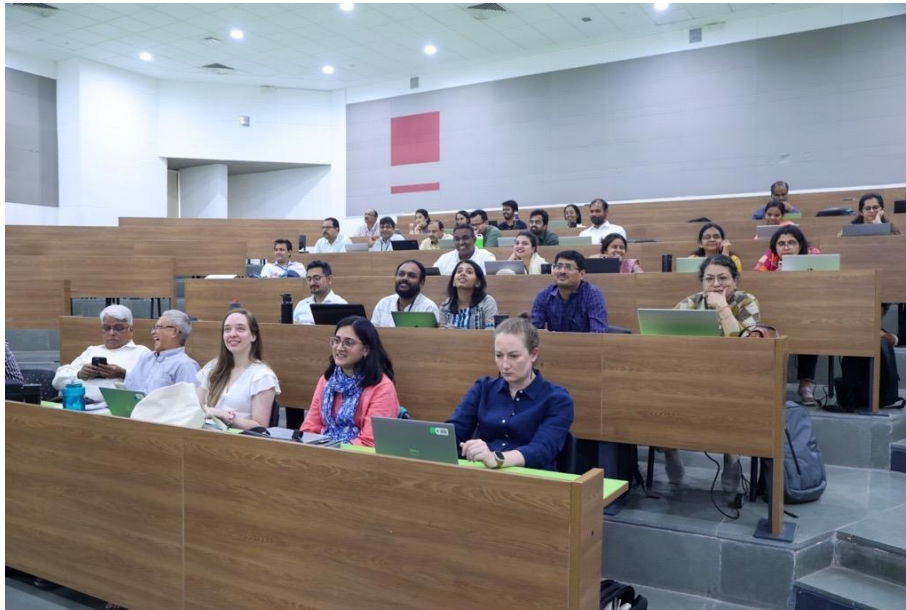
CESD team during detailed discussions on BTR methodologies

By bringing nations together, these initiatives promote solidarity and mutual assistance in pursuit of the universal goal of combating global warming and climate change while ensuring sustainable economic growth. India's commitment to the philosophy of 'Vasudev Kutumbakam,' or the world as one family, underscores the significance of such collaborative capacity-building programs in fostering global cooperation. Such efforts not only benefit individual nations but contribute to the collective endeavour of creating a better world for all.