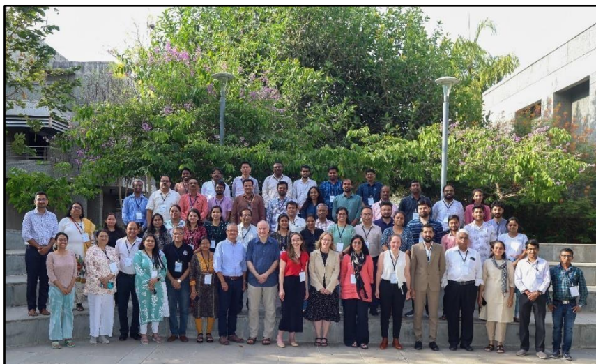
National and International Experts at the training programme in IIT Gandhinagar

A cadre of national and international subject matter experts delivered the training, ensuring a rich dissemination of knowledge and best practices. Participants included representatives from the MoEFCC, academic institutions such as IIM Ahmedabad, IIT Gandhinagar, CIMFR, IIP, ISRO, NIAS, NEERI, IRAI, BITS Pilani, international experts with extensive involvement in such exercises such as representatives from US EPA, and other stakeholders. The programme served as a pivotal platform for experience sharing among key stakeholders involved in the Greenhouse Gas (GHG) inventory estimation for India.