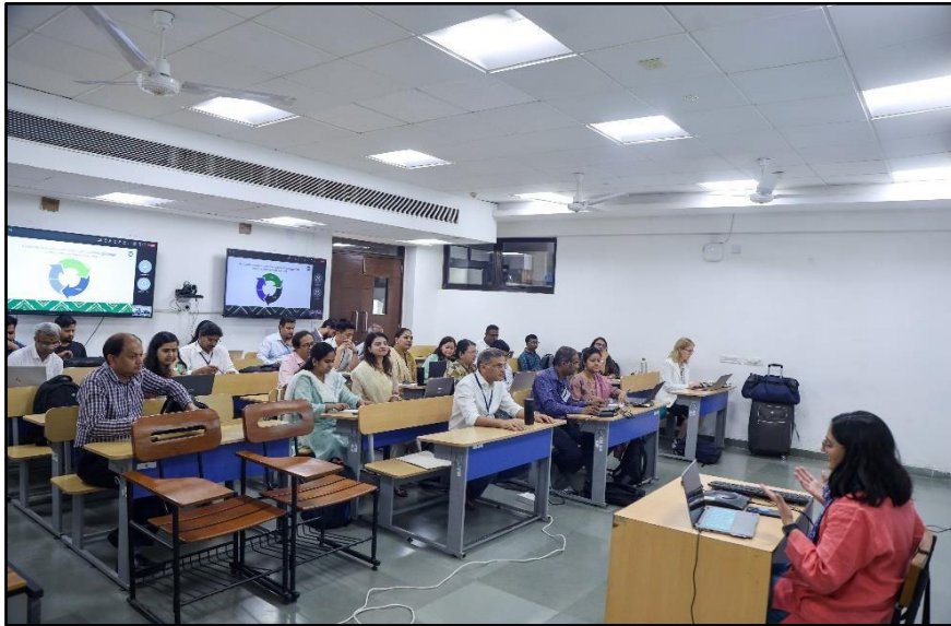
International Expert at a Session Expanding CRT Formats to the Participants

Engaging with international experts provided valuable insights into diverse approaches and methodologies that they have been using for their respective country. The opportunity to network with peers from the ministries and institutions facilitated invaluable exchanges of ideas and best practices, enhancing collaboration and fostering a sense of community within the field.