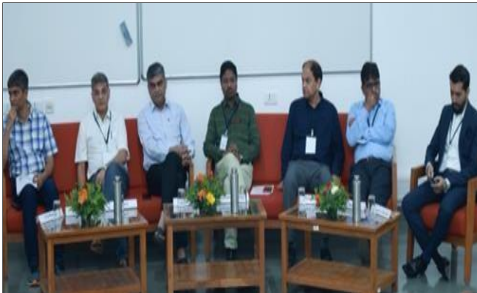
During the opening session of the training program, a panel of experts graced the event with their presence

Organized by the Ministry of Environment, Forests, and Climate Change (MoEFCC), and hosted at IIT Gandhinagar, Gujarat, the sessions were conducted in collaboration with IIM Ahmedabad, CBIT-GSP, IIT Gandhinagar. It was supported by multilateral organizations such as UNEP, USEPA, and GEF.